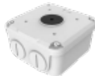
XLGJB06-A Junction Box