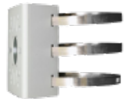
XLGUP06 Pole Mount

*Design and specifications are subjects to change without notice.