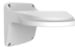
XLGWM04 Wall Mount