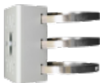
XLGUP06 Pole Mount